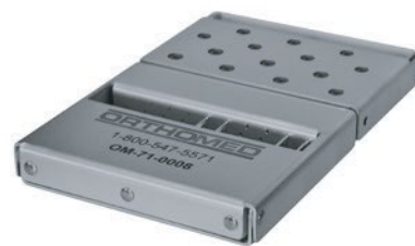
Case in closed position.

6 1/4" x 4 1/8" x 3/4" (closed) (158mm x 105mm x 19mm)