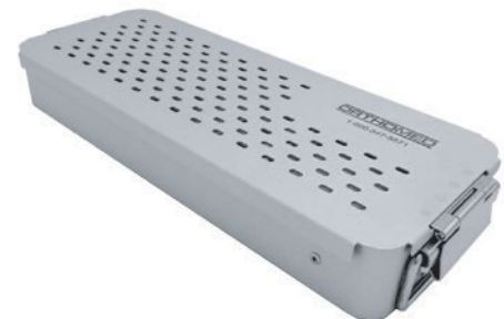
Case in closed position.