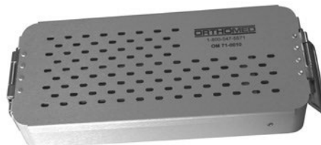
Case in closed position.