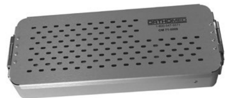
Case in closed position.