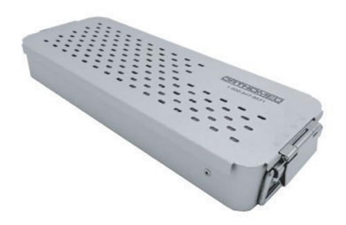
Case in closed position.

OM 71-0011 13 5/8" x 5 1/4" x 2 1/4" (closed) (346mm x 133mm x 57mm)